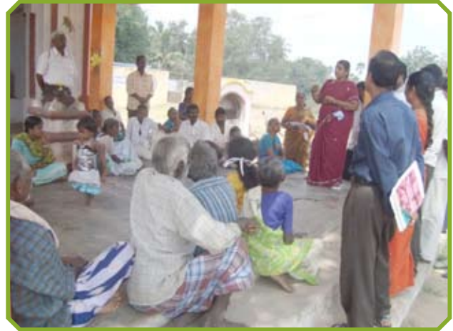
Trainees engaged in FGD during the training in Situation Analysis

Eight NGO Partners of Tiruvallur in Tamilnadu, along with Resource Persons and Training Center personnel, were given inputs on Situation Analysis from 9-12 Feb 2013 as CABRF believes it is important to acknowledge the present reality and build on it. These inputs will be given to other partners during the coming year, 2013-2014. Information collected will serve as a base-line to evaluate progress made in due time.