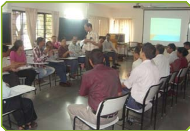
Participants engaged in discussion with the facilitator during RBM training.