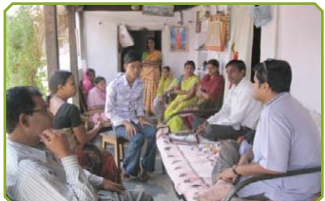
The trainees participating in the input session and interacting with PwDs during the training facilitated by SANCHAR, Kolkata.