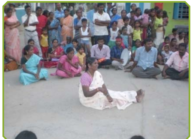
CBR workers and Coordinators interacting with the community and raising awareness through street theatre as part of training facilitated by ADD India.