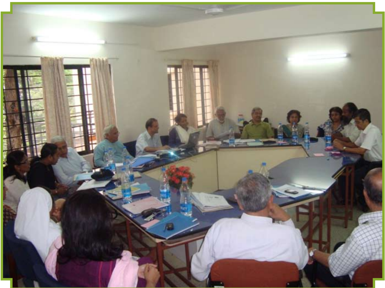
Meeting of the General Body

The General Body of Collective Action for Basic Rights Foundation met on 10 May 2012, while the Governing Body met twice during the year on 10 May 2012 and 31 Oct 2012.