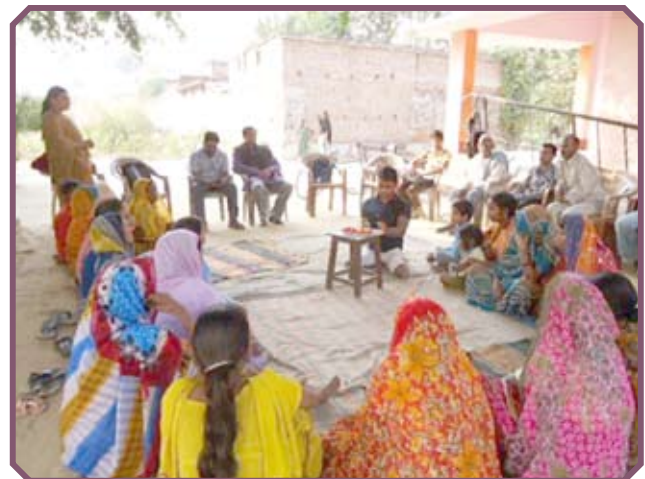
Resource person interacting with the DPO members during facilitation visit at PGSS, Uttar Pradesh.

During the year, in collaboration with Caritas India CBR Forum, Collective action for Basic Rights Foundation (CBRF) visited the project sites of 8 partners from Yavatmal, 1 from Pondicherry and 1 from Gorakhpur, UP in view