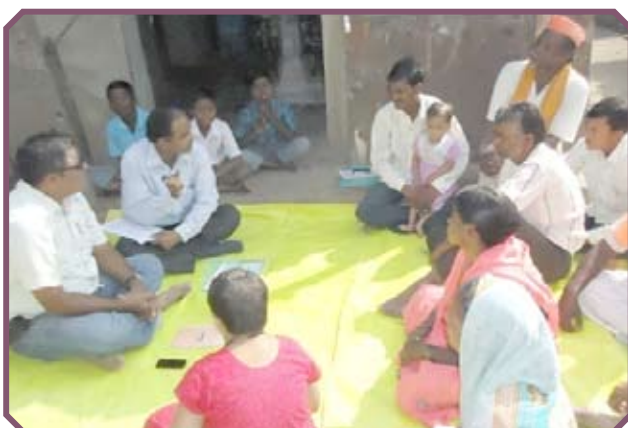
Facilitation visit in Maharashtra

of ensuring that disability was mainstreamed in these organizations in an effective manner. It also stressed the need for these partners to work as a team so as to have an impact at District level and bring about a perceptible change in the lives of Persons with Disability.